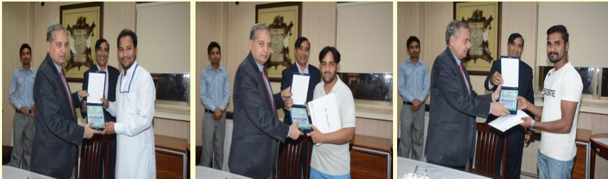
The Director General distributing certificates amongst minority employees for their services to the Academy.

The Director General hosted a Hi-Tea to acknowledge the services of Christian employees and expressed his satisfaction over their performance. In his address, the Director General said that minorities are an important pillar of Pakistan and no nation can prosper without taking them along. The employees of minority communities, therefore, deserve special appreciation.